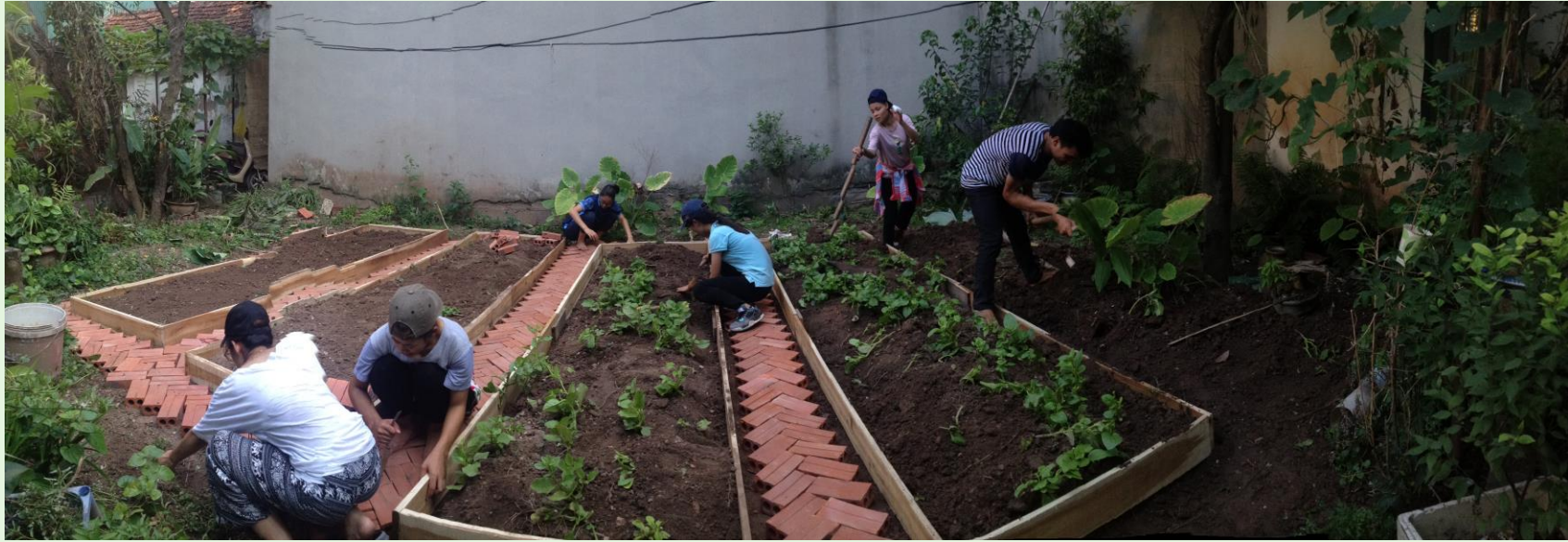
6 students worked with 6 households, using recycled brick and wood to set up their garden, at Ngoc Ha Ward, Ba Dinh District, Hanoi.