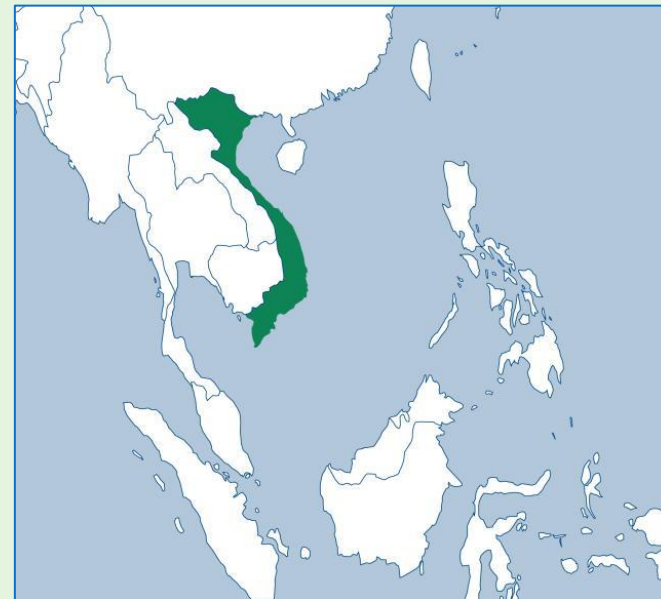
Map of Vietnam, Irish Aid, 2015