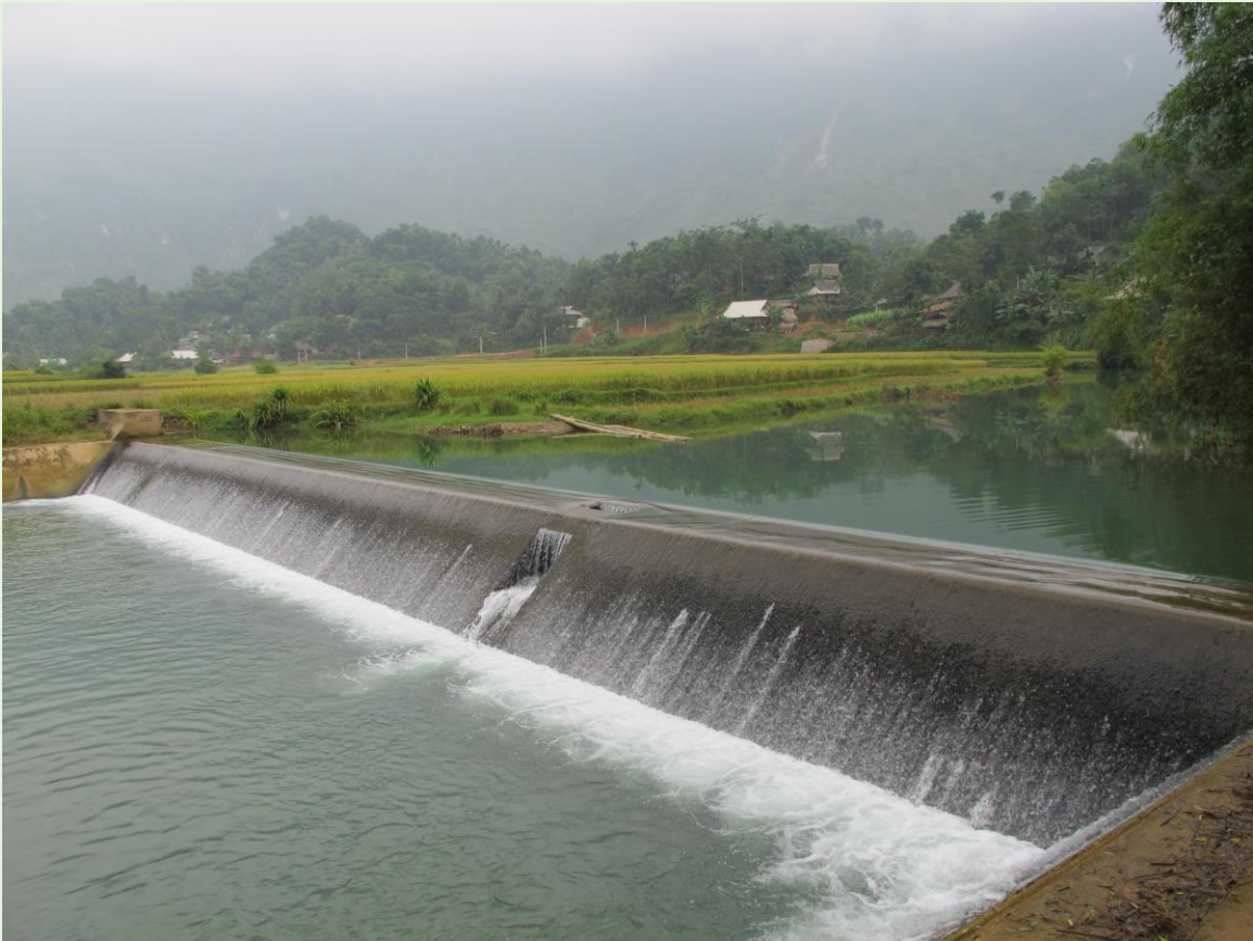
An irrigation dam built under Programme 135 in Thanh Hoa province.