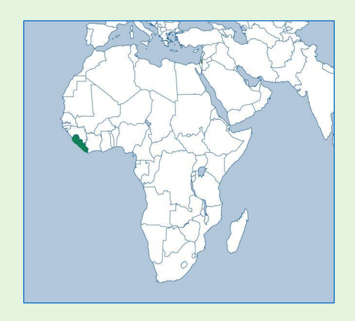
Map of Sierra Leone, Irish Aid, 2015