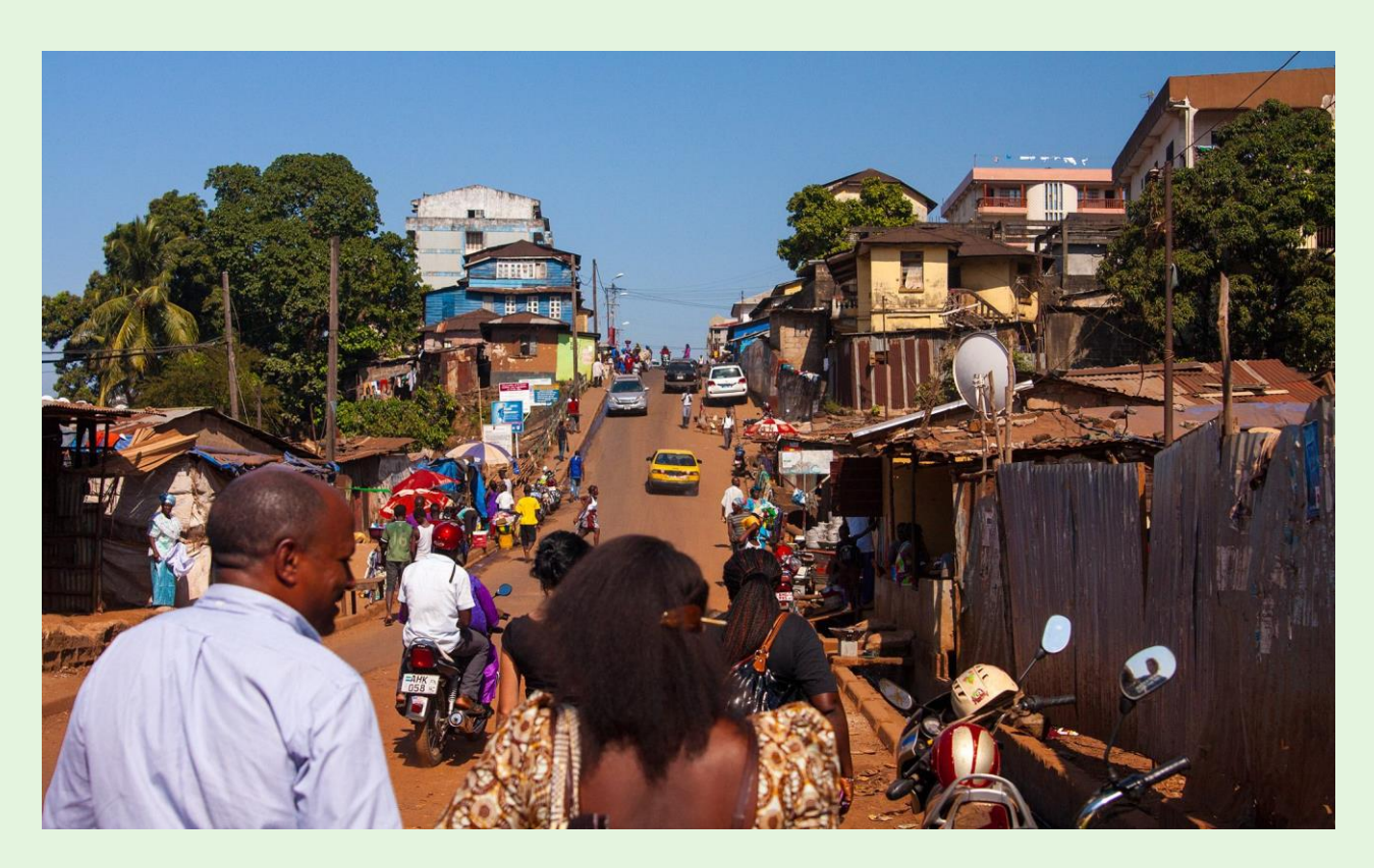
Freetown Streetscene, Sierra Leone.