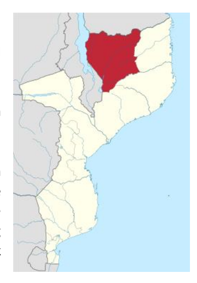
Figure 2 Niassa Province

malnutrition are particularly acute in Niassa. Malnutrition rates of 46.8% are recorded particularly amongst pregnant and lactating women. Furthermore, the province has historically registered very low rates of participation by girls in school.