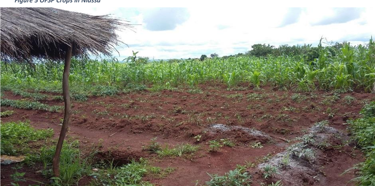
Figure 5 OFSP Crops in Niassa

Partnerships with the Provincial Directorates of Public Works have bolstered the resilience of poor communities through improving access to water with an emphasis on improving climate resilience and through the establishment and training of community committees for water management, and the training of local mechanics to undertake basic maintenance and repairs. Partnership with the National Institute for Disaster Management (INGC) has resulted in the elaboration of an action plan for the prevention and mitigation of natural disasters and its roll-out at local level through the creation, training and equipping of Local Committees for Disaster Risk Management. However, so far this has only been rolled out in one district.