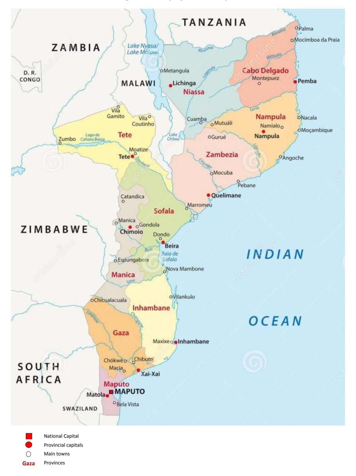
Figure 1: Map of Mozambique