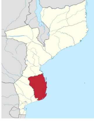
Figure 3 Inhambane Province

enough to feed its population. Moreover, Inhambane is particularly susceptible to climatic events that often lead to humanitarian crises. The province suffered from a prolonged drought for much of 2015 and 2016, and the coastal area is regularly hit by tropical storms and cyclones resulting in serious damage to infrastructure, livelihoods and population displacement.