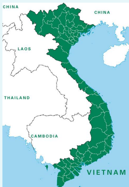
Map of Vietnam: Irish Aid