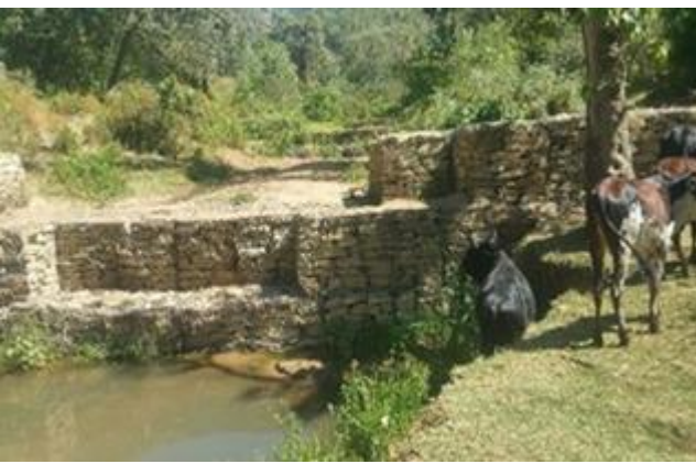
Images above show before and after pictures of the valley following construction of a check dam, which provides a source of drinking water, irrigation and household consumption.