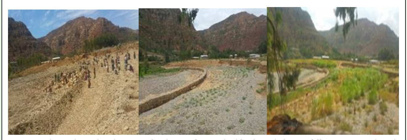
Images above show the change in landscape from a highly degraded area following an Irish Aid supported programme of integrated soil and water conservation and rehabilitation, through a watershed management approach.

In 2014, Irish Aid supported the World Agroforestry Centre (ICRAF) to implement 'Enhancing Integrated Watershed Management with Climate Smart Agriculture in Gergera Watershed', in order to build on the successes and earlier investments in the watershed management approach. The overall objective of the project is to enhance food security and ecosystem resilience through climate-smart landscape management and restoration practices, approaches and technologies and through strengthening of rural institutions and vulnerable community members including women, poor and the youth.