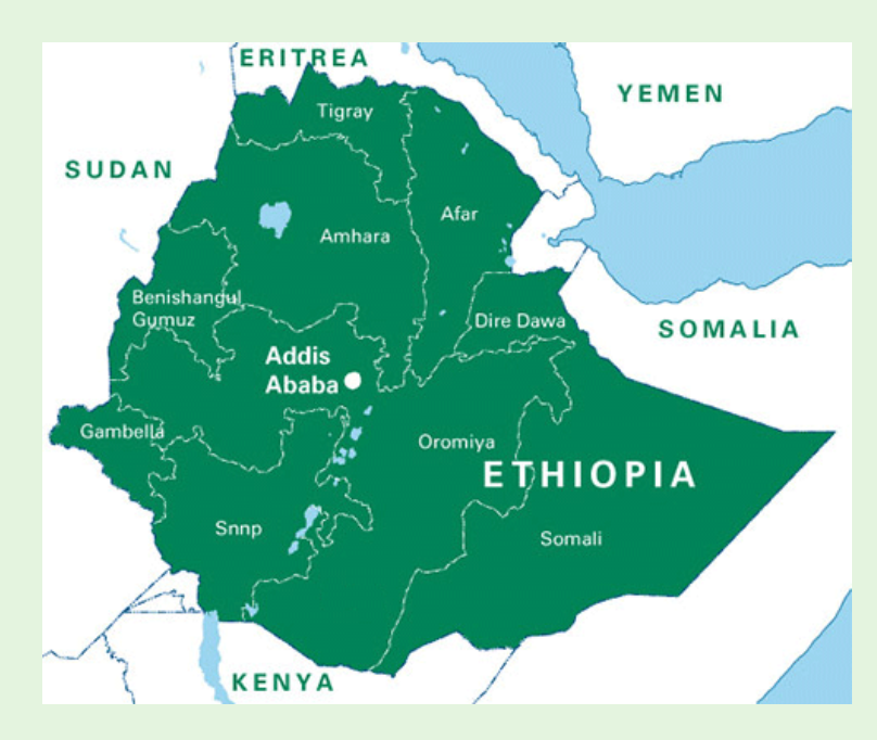
Map of Ethiopia: Irish Aid